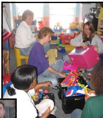
Volunteers cleaned every last toy in the Children's Services Room at Haven House (above) and took a moment to admire their hard work (left).

To learn more about volunteering with ForKids through VOLUNTEER Hampton Roads, visit www.volunteerhr.org .